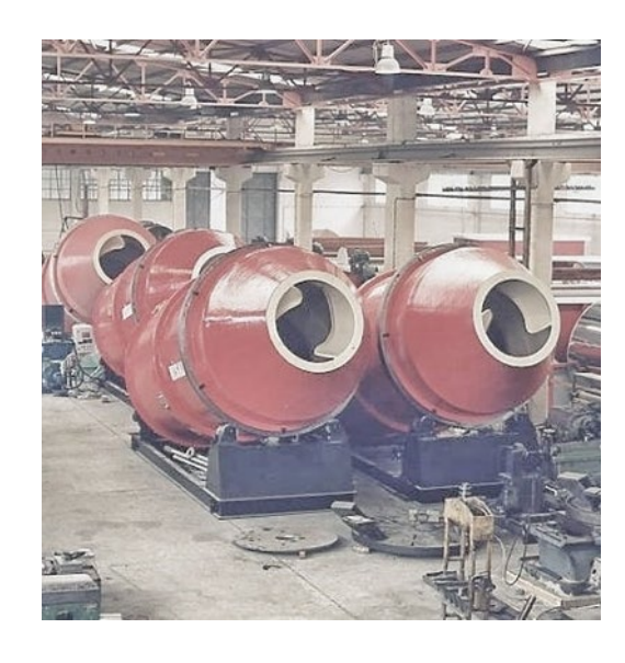
mixers in required capacities

in addition to our standard mixer production; additional features, accessories and equipment can be used according to customer demands, as well as productions in intermediate dimensions and diameters to provide ease of transportation. that means, production is completely customeroriented.