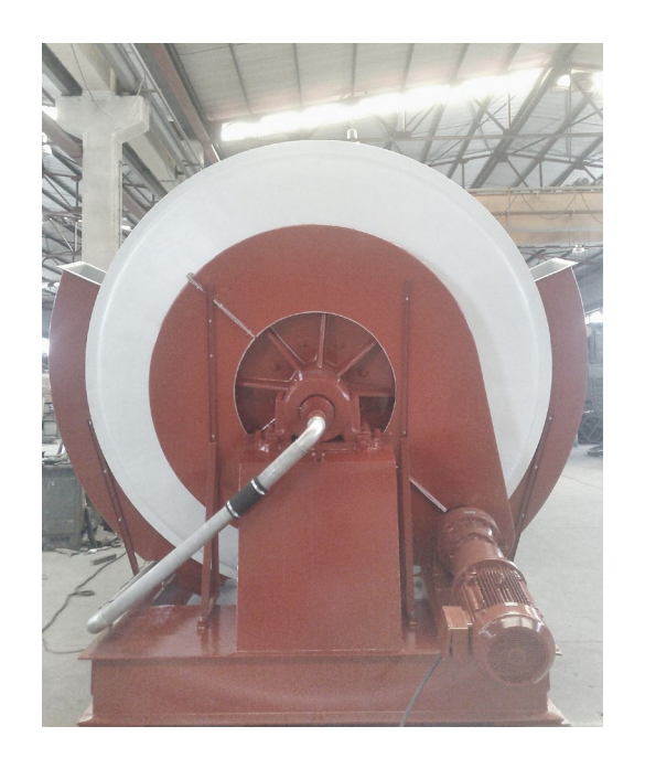
on-site installation service